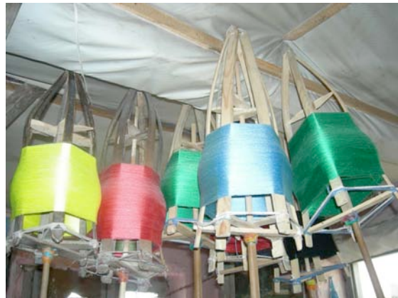
Thread for Weaving

The PARSA Gift Shop in Karte Se is open everyday except Friday for sales of clothes and crafts.