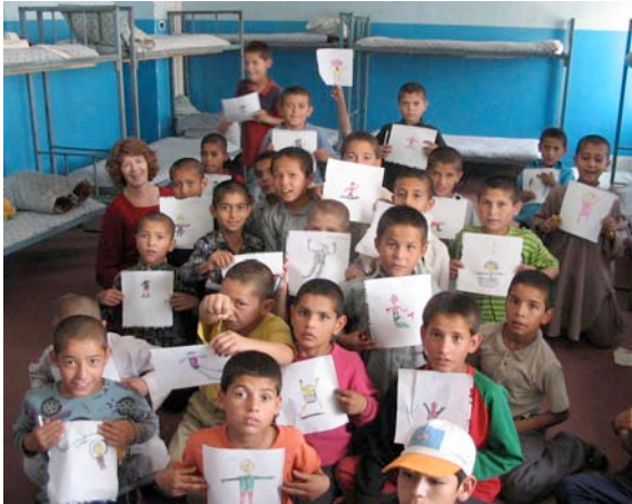
Yoga Class at the Orphanage