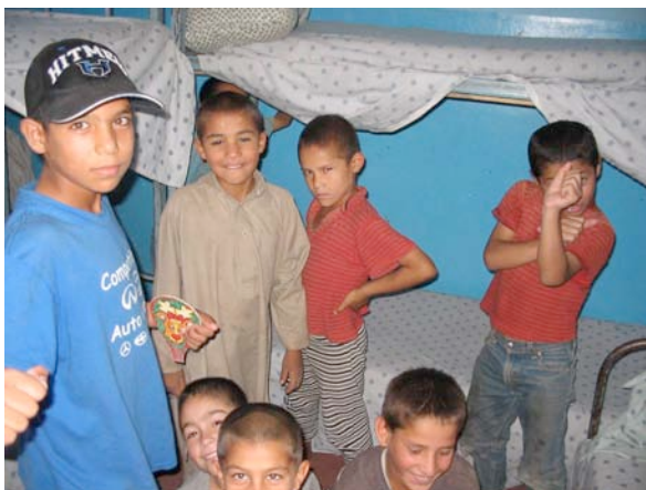
Boys at the Orphanage

Our immediate effort has focused on getting badly needed medical attention to about 20 of the children including taking them out to see the eye doctor. Yasin took two of the children to ICRC to get them fitted for prosthetics. Guru Sewak is focusing on developing activities that the supervisory staff can manage without the kids getting out of control. We are as yet not allowed to work with the girls. We have encountered other organizations that are attempting to get support to the orphans but it tends to be erratic.