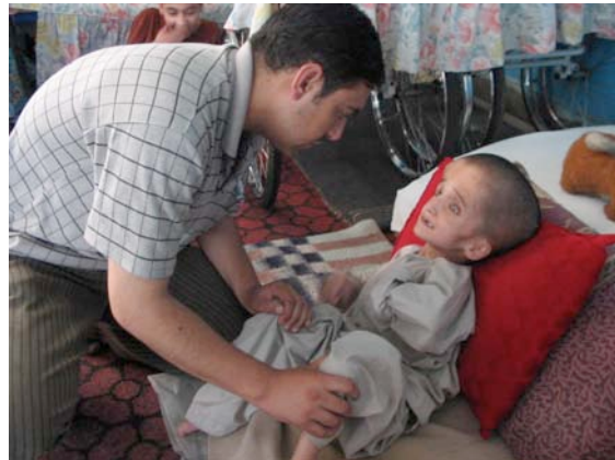
Atikula and Sair Physical Therapy

Conditions at the orphanage are difficult, staff members are only paid $40 a month. Many of the staff have worked there for close to 30 years. When the orphans are not in class, one staff person supervises 250 boys and one staff person supervises 200 girls. After school, there are no scheduled activities. If the children are not in class they are in their rooms, often sleeping because there is nothing else to do. The staff discourages field trips because they are afraid the children will run away.